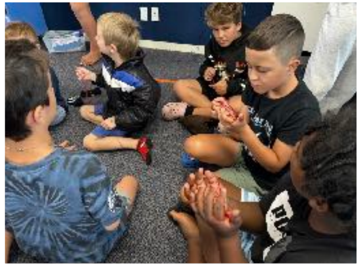
Cultural Groups preparing for the Festival of Cultures

Welcome to week 7. It sounds like we are almost through the term but this is an 11 week term so still quite a way to go.