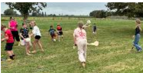
Cultural Groups preparing for the Festival of Cultures