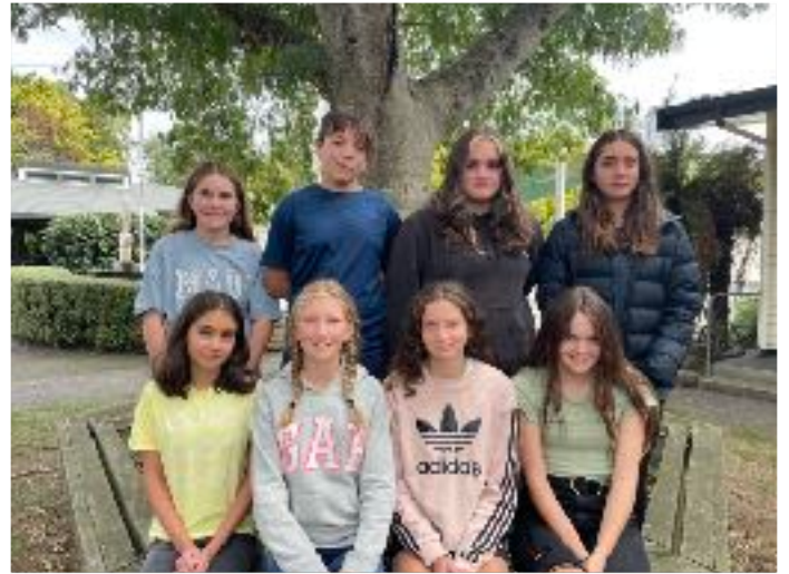
2022 Student Council

Welcome back to our students and staff who were isolated at home last week due to COVID19 being in the school. The majority are back now and getting on with the business of learning. During their absence the rules around isolation changed as the country moved into Phase 3. I shared a flowchart on our social media feed and Seesaw that details our response should a positive case be notified. Essentially children can, and are encouraged to, come to school unless they have Covid-19 or someone in their home returns a positive test. I have reproduced the flowchart in this newsletter for those that missed it.