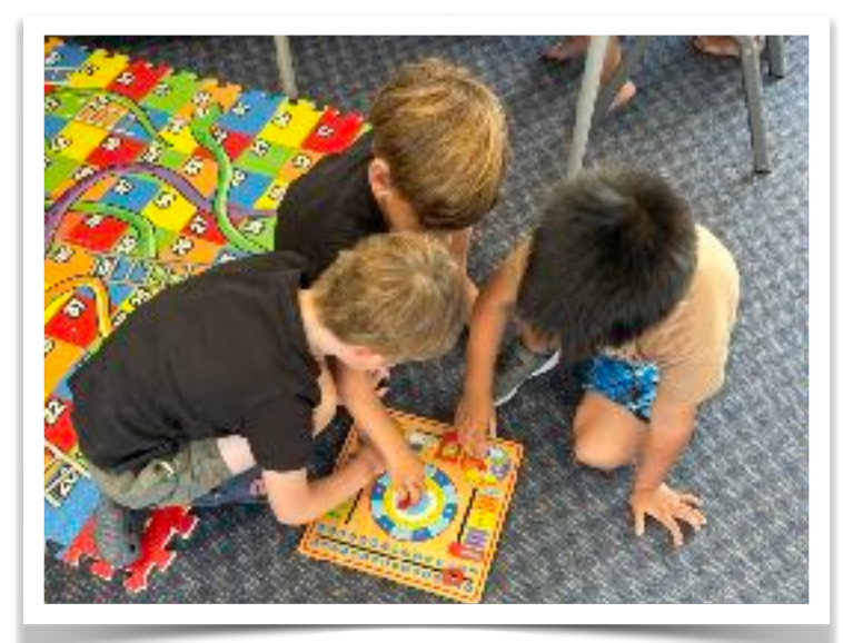
Some of our newest and youngest learners

Welcome to Week 2. Time wise, It's always a bit of a ropey start to the school year. With Auckland Anniversary followed closely by Waitangi Day, it seems like a long time before we get a full week in and the year starts in earnest. The School year