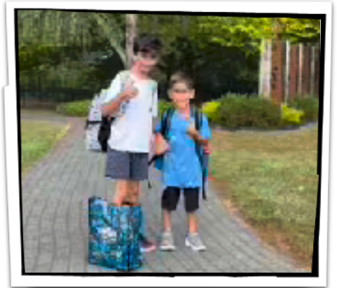
Big brother bringing little brother in for his first day.