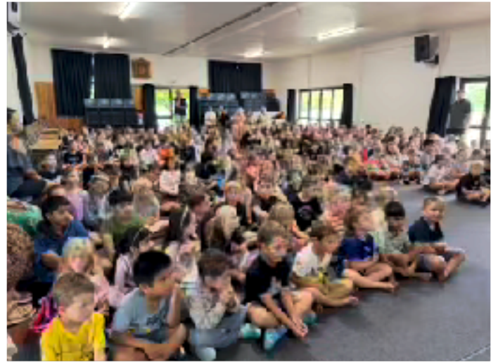
Welcome back assembly

Welcome to another school year. To those joining our community for the first time, welcome to our school. For those of you returning to Gordonton School, welcome back. The staff and I look forward to another year of learning, growth, progress and achievement.